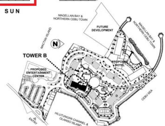
SITE DEVELOPMENT PLAN

While every care has been taken in preparing this material, all plans, details and specifications contained herein are subject to change without prior notice and do not constitute part of any offer or contract. No warranty or representation is made by the Developer as to their accuracy. Furthermore, the Developer reserves the right to alter, deviate or dispense with the plans and specifications referred to herein. Furniture, appliances and equipment indicated herein are for illustrative purpose only and are not included in the deliverables.