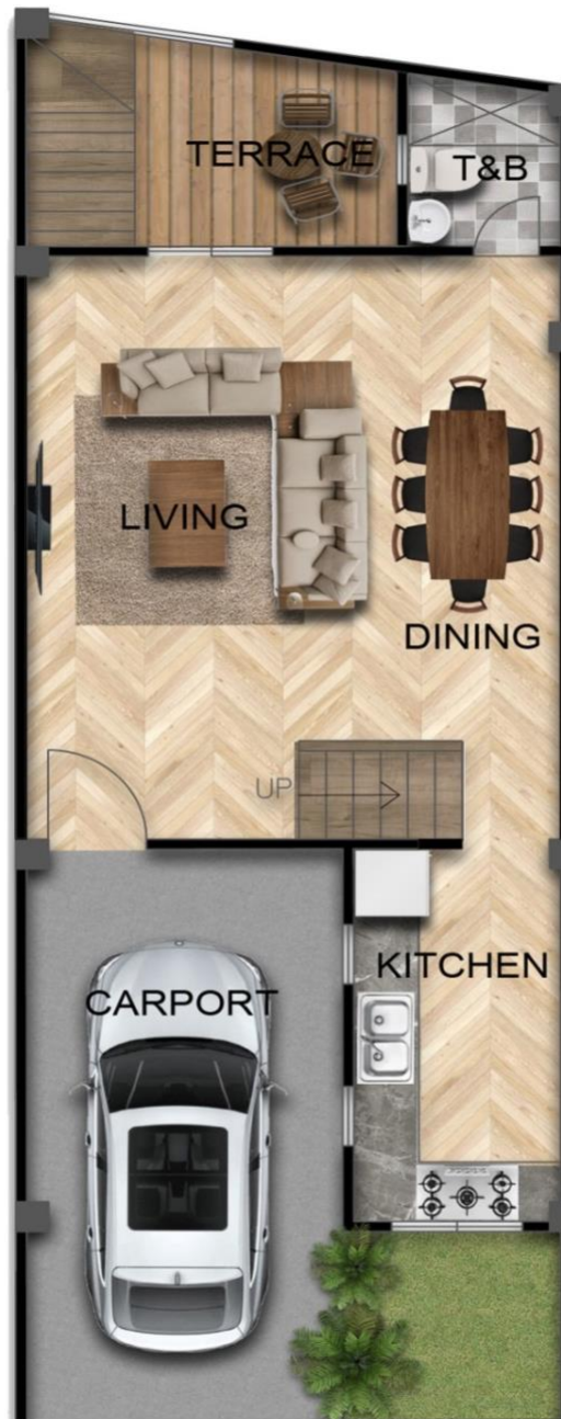
GROUND FLOOR PLAN (UNIT A)