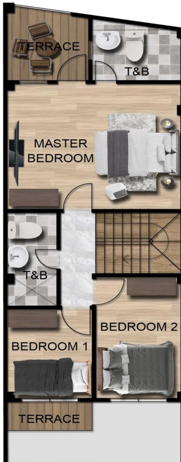
SECOND FLOOR PLAN (UNIT A)