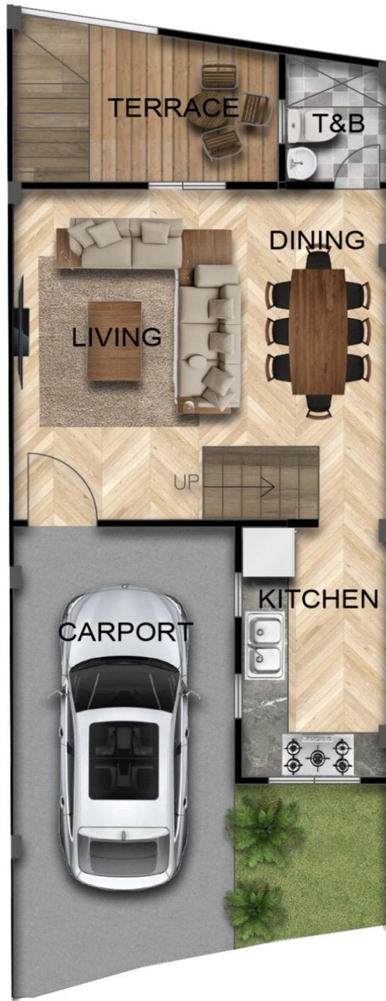
GROUND FLOOR PLAN (UNIT B)