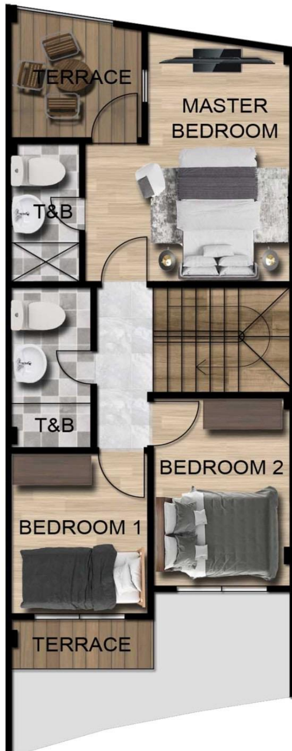
SECOND FLOOR PLAN (UNIT B)