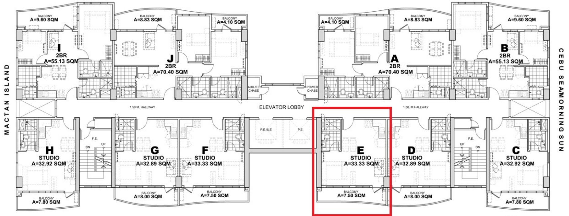
TOWER C - 10/F to 18/F TYPICAL FLOOR PLAN ZONE 2 NOT TO SCALE